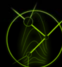
BIOMETRIC SENSOR SCANNING